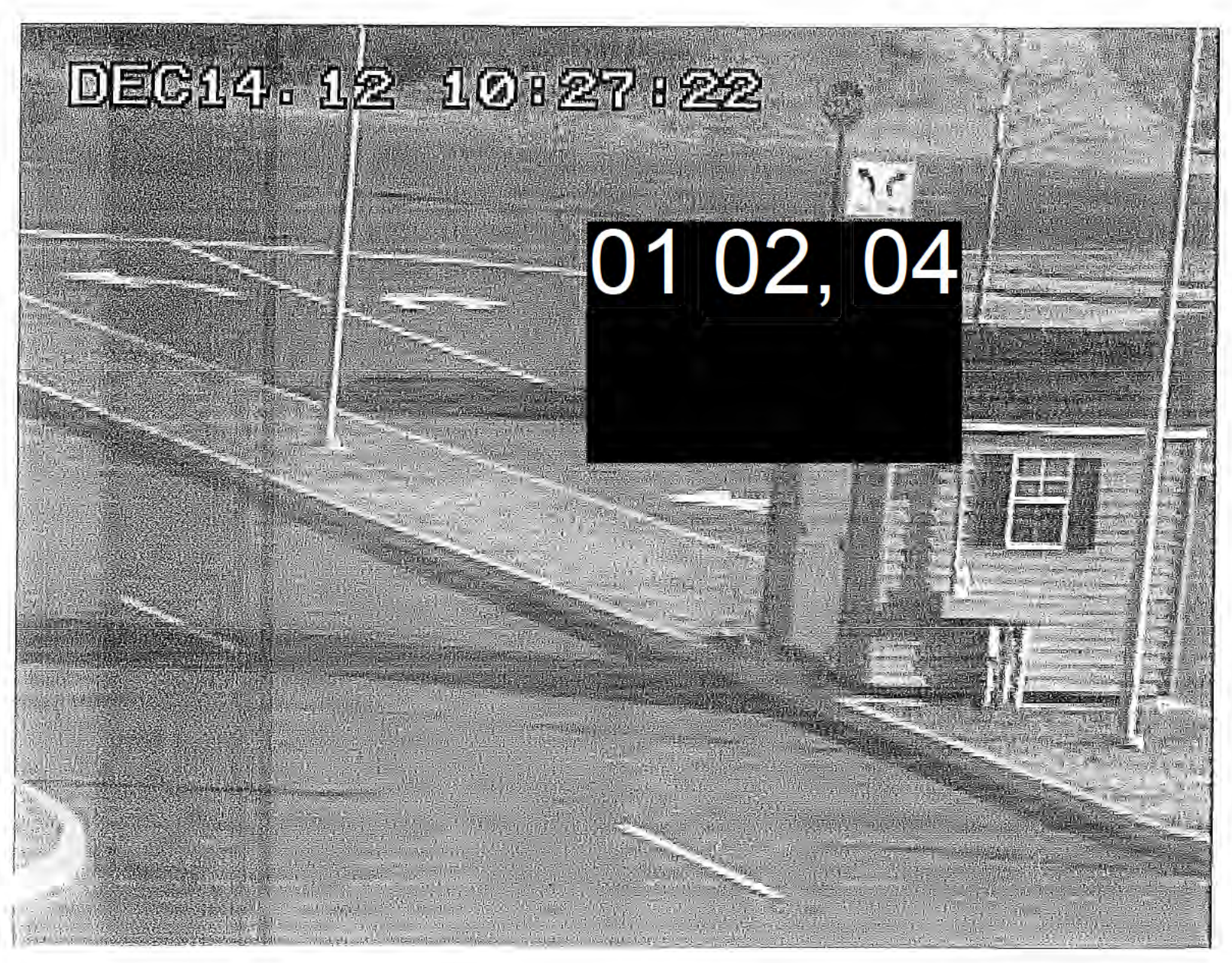
Camera[4] No[76] Time: [12/14/2012 10:27:22 AM]