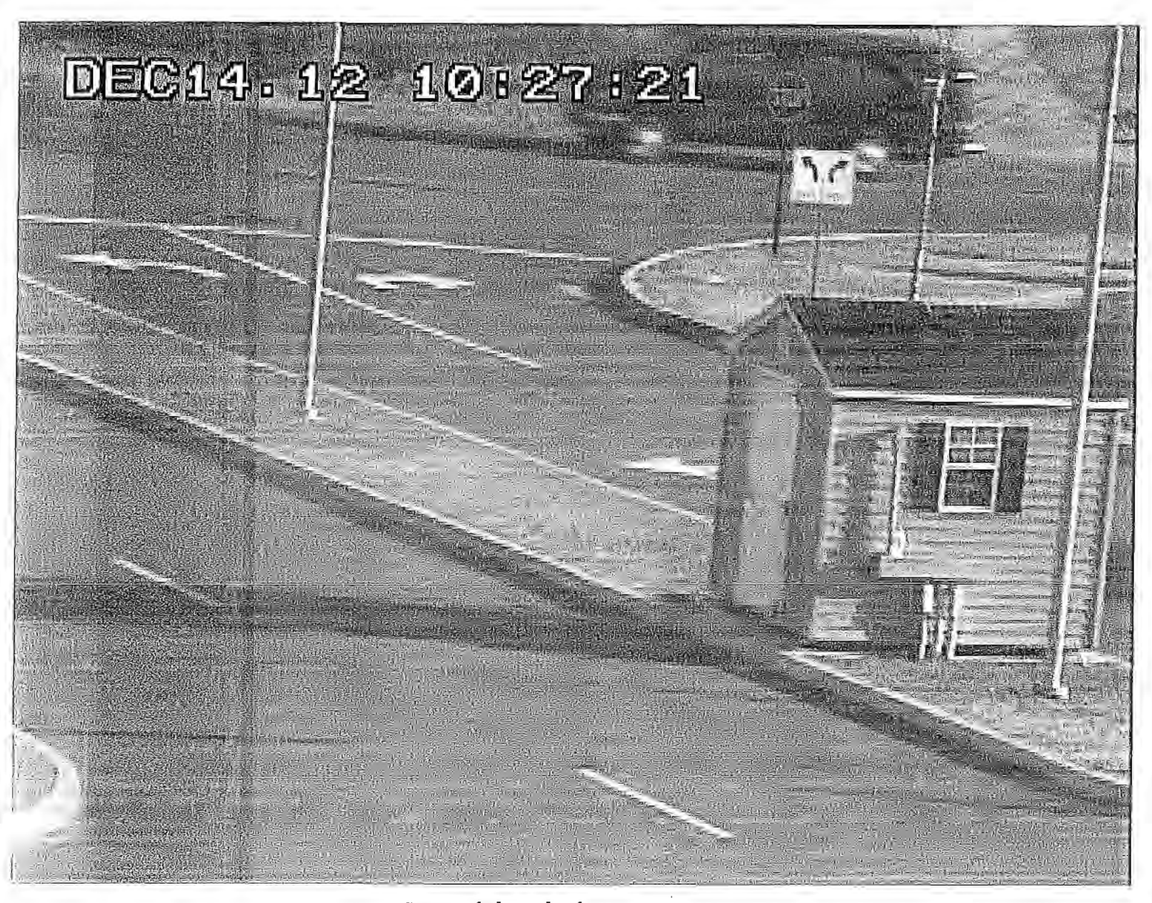
Camera[4] No[64] Time:[12/14/2012 10:27:21 AM]