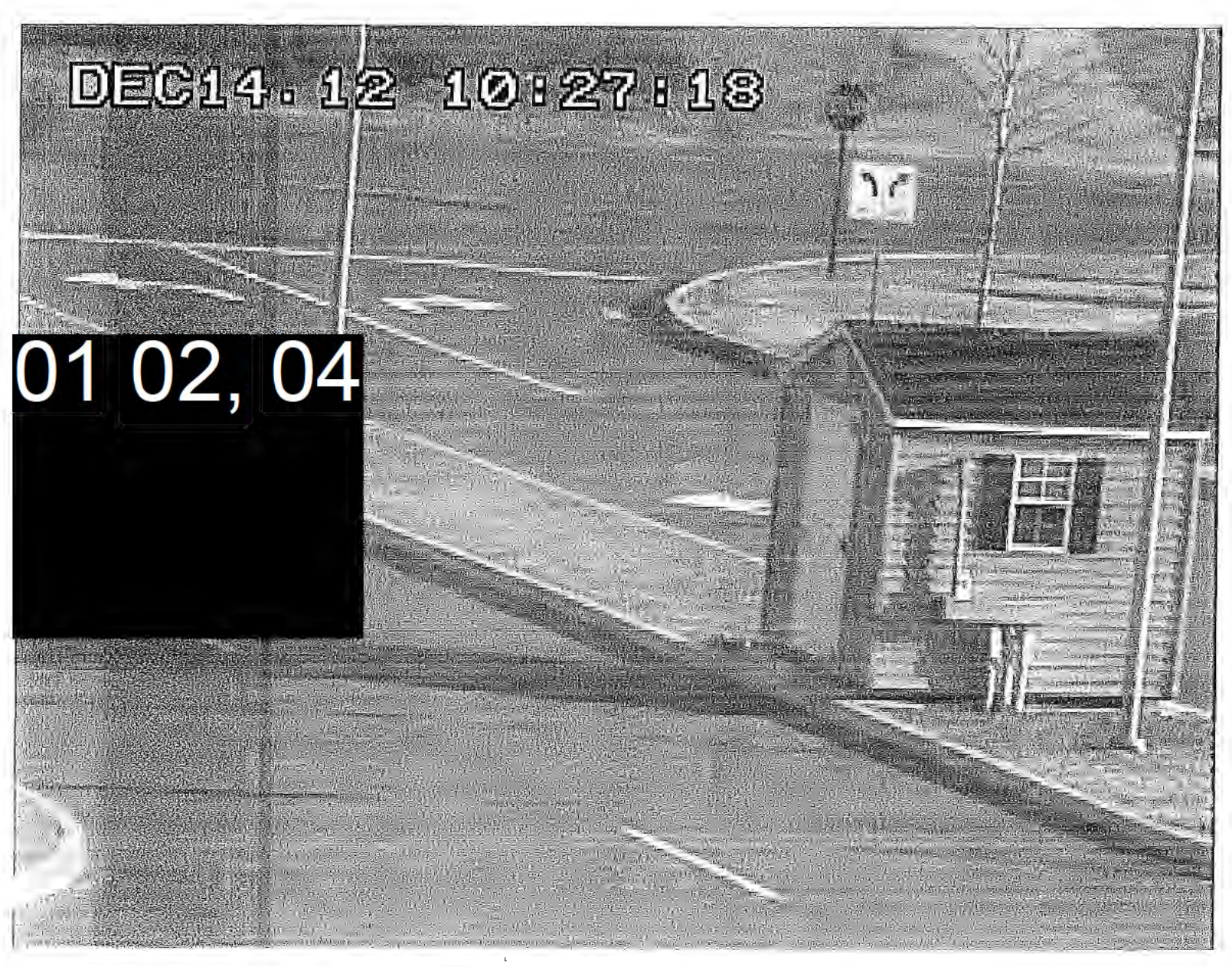
Camera[4] No[40] Time:[12/14/2012 10:27:18 AM]