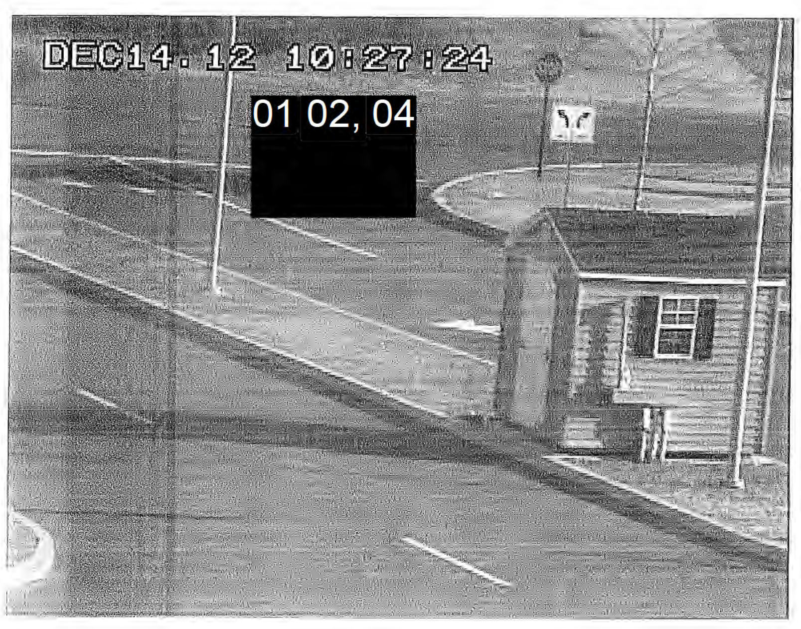
Camera[4] No[88] Time: [12/14/2012 10:27:24 AM]