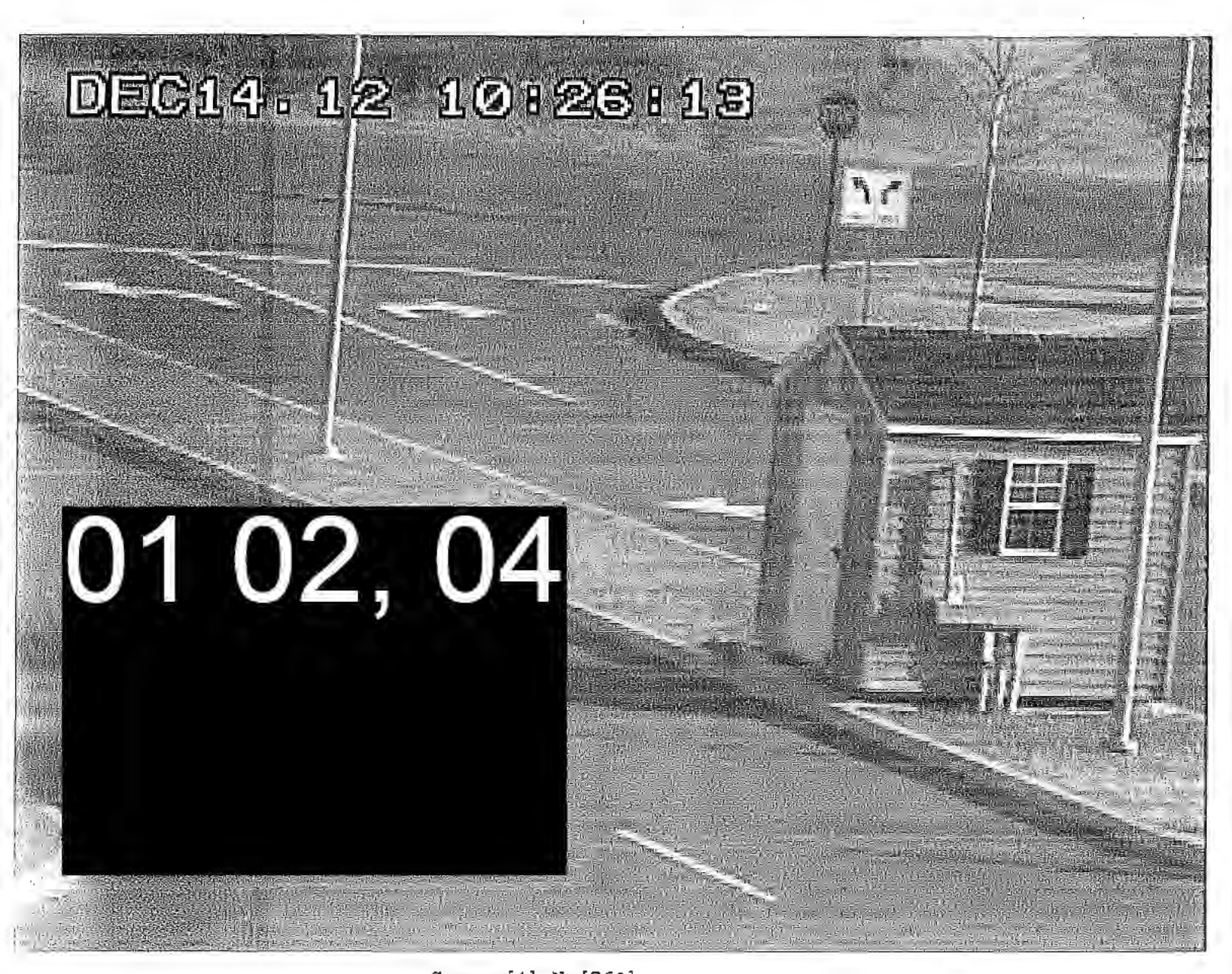
Camera[4] No[760] Time: [12/14/2012 10:26:13 AM]