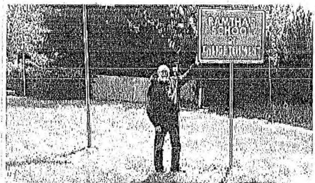
Sign along WA 510. The entrance to Ramtha's School of Enlightenment is in the background on the left.